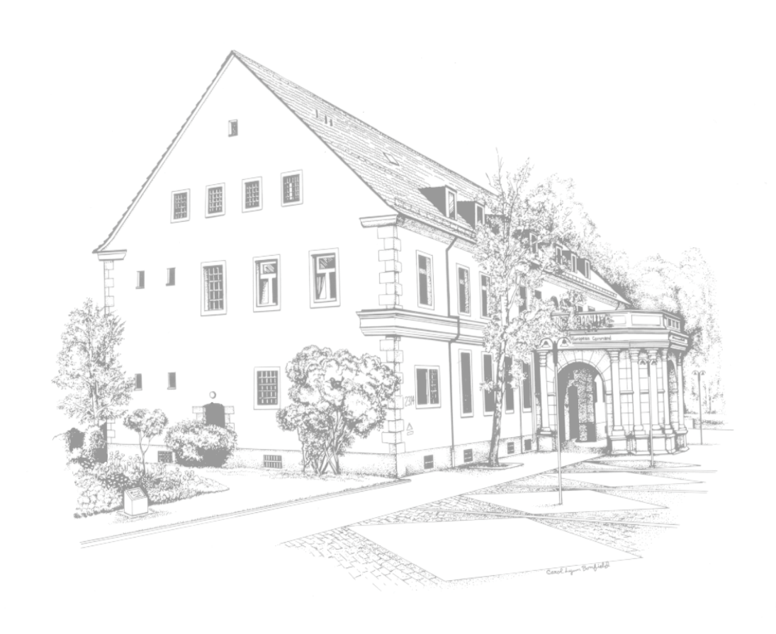
"Stronger Together since 1952"