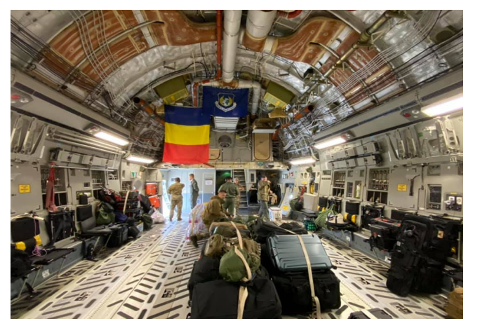
The Heavy Airlift Wing based out of Pápa Air Base, Hungary, recently assisted with the international Strategic Airlift Capability mission to deliver medical and personal protective equipment to Romania.