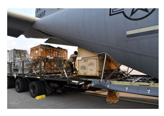
Airmen assigned to the 721st Aerial Port Squadron load pallets of medical supplies onto a C-130J Super Hercules to provide medical support to Italy.