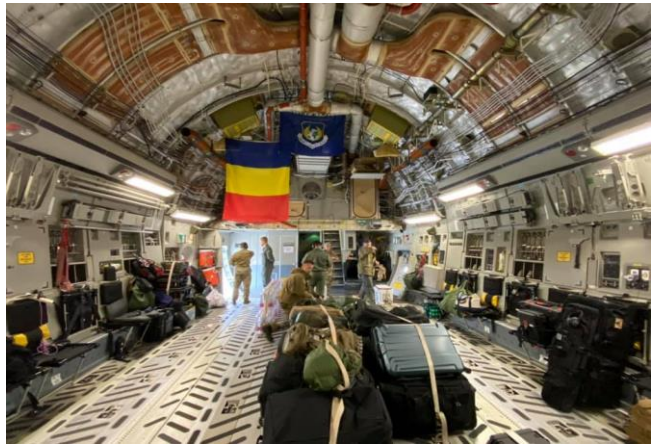
The Heavy Airlift Wing based out of Pápa Air Base, Hungary, recently assisted with the international Strategic Airlift Capability mission to deliver medical and personal protective equipment to Romania.