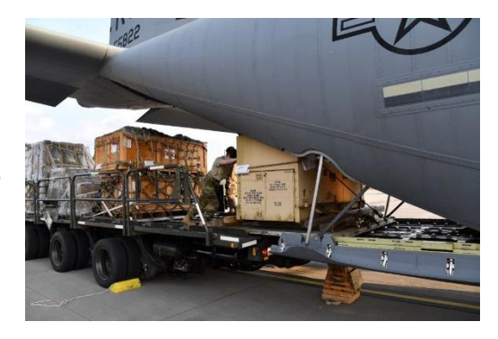
Airmen assigned to the 721st Aerial Port Squadron load pallets of medical supplies onto a C-130J Super Hercules to provide medical support to Italy.