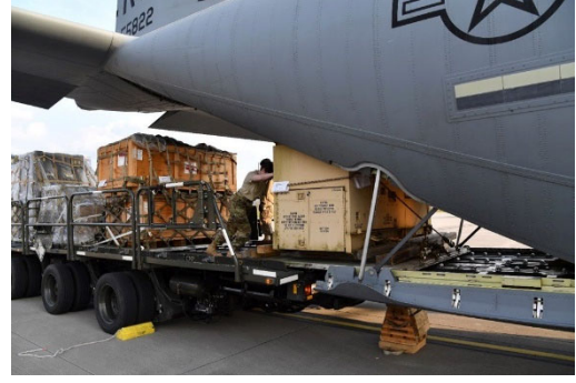
Airmen assigned to the 721st Aerial Port Squadron load pallets of medical supplies onto a C-130J Super Hercules to provide medical support to Italy.