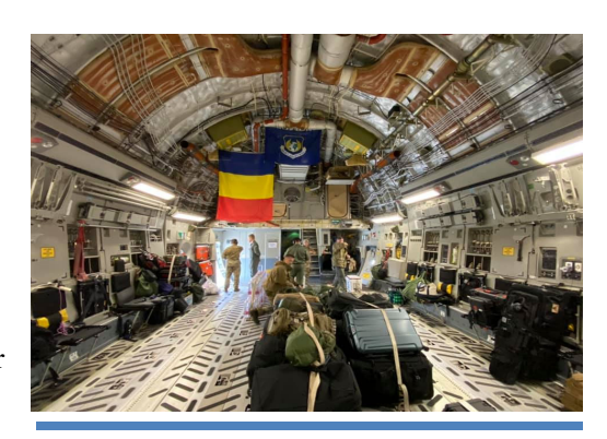
The Heavy Airlift Wing based out of Pápa Air Base, Hungary, recently assisted with the international Strategic Airlift Capability mission to deliver medical and personal protective equipment to Romania.