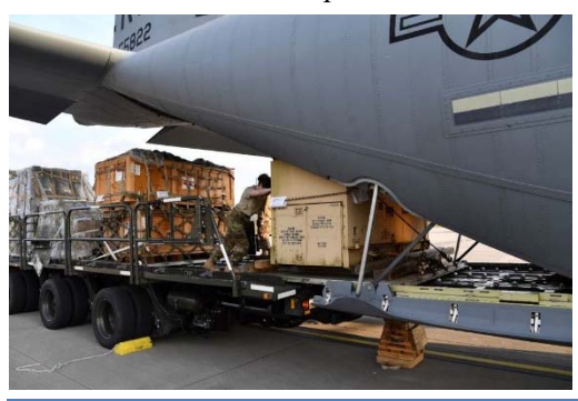
Airmen assigned to the 721st Aerial Port Squadron load pallets of medical supplies onto a C-130J Super Hercules to provide medical support to Italy.