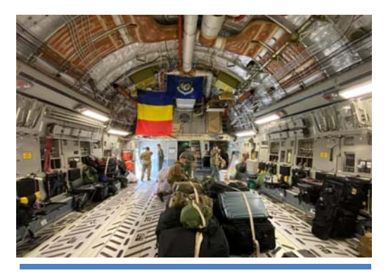
The Heavy Airlift Wing based out of Pápa Air Base, Hungary, recently assisted with the international Strategic Airlift Capability mission to deliver medical and personal protective equipment to Romania.